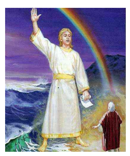
The Man in Linen

"And in the midst of the seven candlesticks one like unto the Son of man, clothed with a garment down to the foot, and girt about the paps with a golden girdle." (Revelation 1:13 AV)