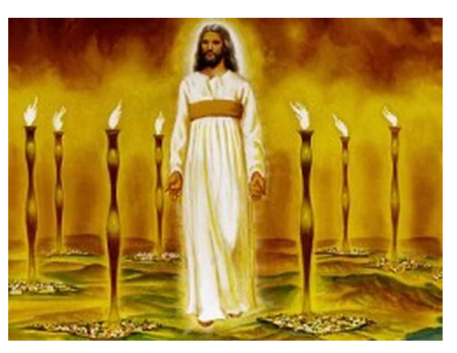
Christ amongst the candlesticks