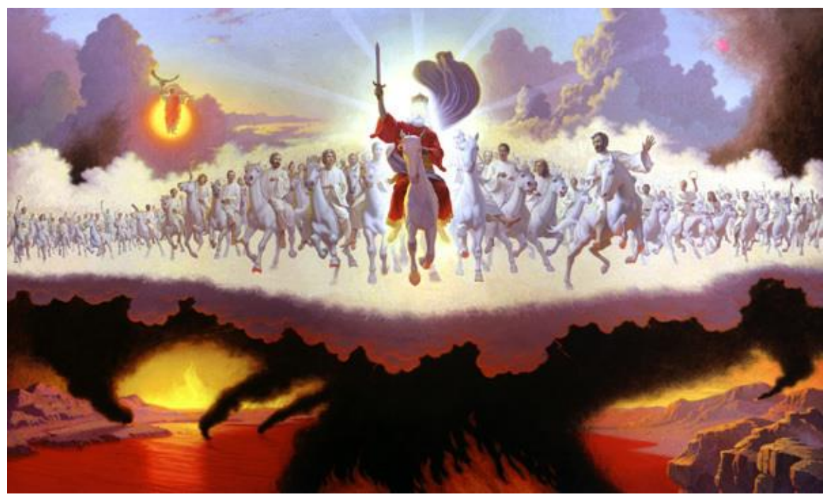
The Melchizedekian eschatological High Priest and Holy Warrior. Commander of the Luminaries.

THE MEMRA: A Rabbinical intermediary revealing the word of God. Philo represents the logos as the eldest angel, the many seventy names of the archangel Jehovah. The Adam kadmon depicts the logos as a human reflection of the eternal God. God in the heavens, the mid-heavens and the earth.