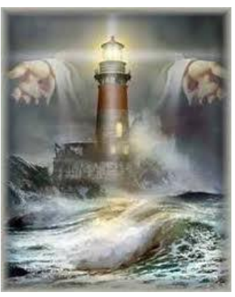
Jesus the Lighthouse