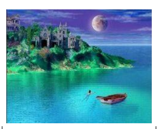
Turquoise sea dream